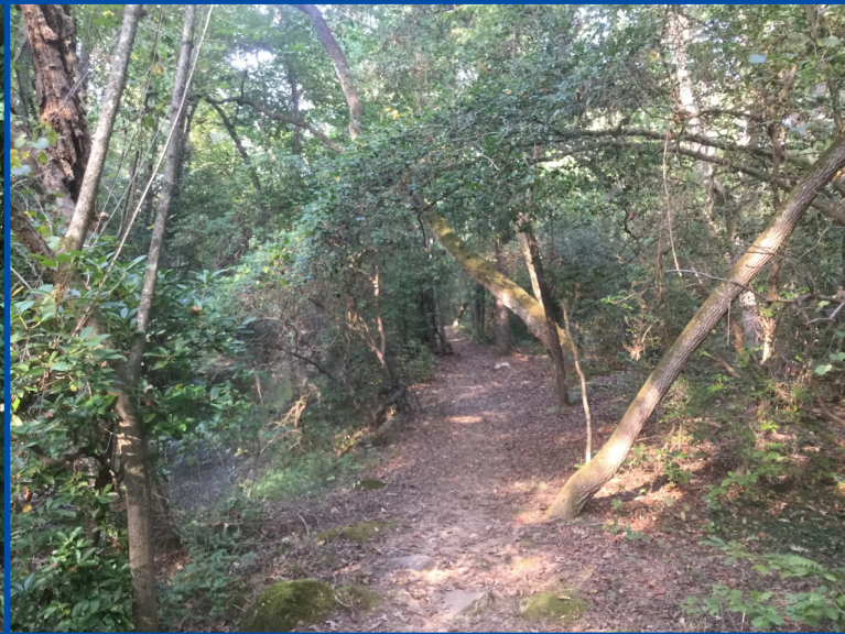
4 - Site View